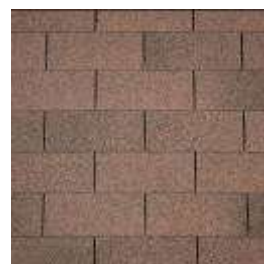
07 - Brown