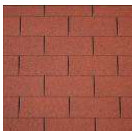
10 - Red