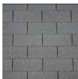
31 - Slate