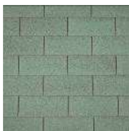
03 - Green